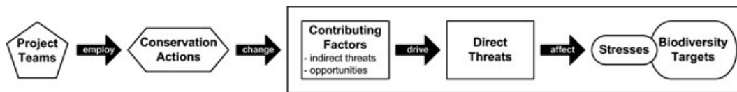
Figure 1. A general model of a conservation project. Conservation actions can be applied to contributing factors, direct threats, or even to biodiversity targets as indicated by the box around these factors. See text for definitions.

a chain of contributing factors behind any given direct threat. In a situation analysis, these factors are often subdivided into indirect threats (factors with a negative effect, such as market demand for fish) and opportunities (factors with a positive effect, such as a country's land-use planning system that favors conservation). Contributing factors are synonymous with underlying factors , drivers , or root causes .